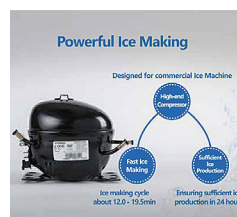
Powerful Ice Making