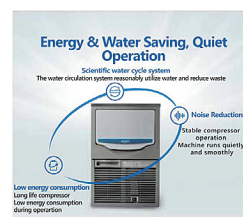
Energy & Water Saving, Quiet Operation